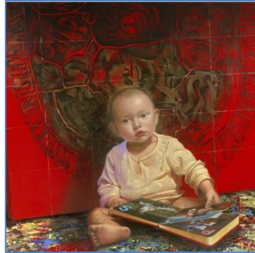
The Fairer Hand