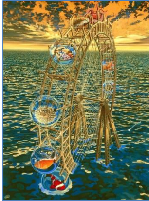
Fish Ferris Wheel