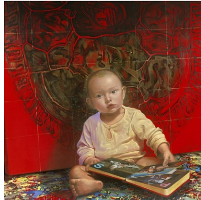
The Fairer Hand