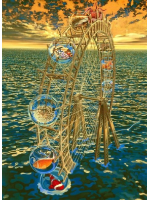
Fish Ferris Wheel